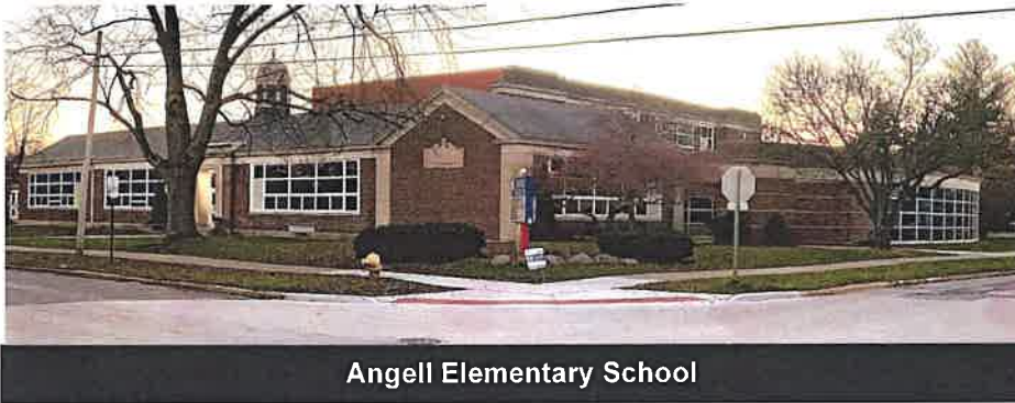
Angell Elementary School