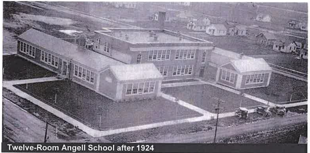
Twelve-Room Angell School after 1924