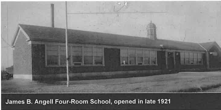
James B. Angell Four-Room School, opened in late 1921