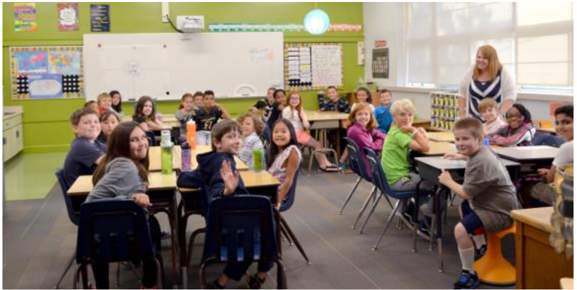
This Parent Resource Guide includes activities you can use at home to help your child learn the five (5) components of reading:

Read at Home Plan for Student Success TK-3<sup>rd</sup> Grade